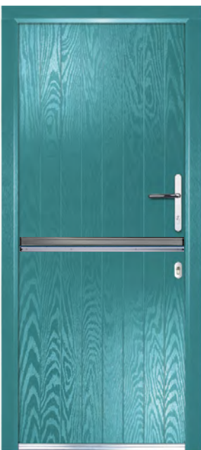
Door Colour: Turquoise Blue