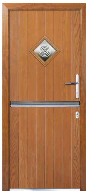
Door Colour: Golden Oak Decorative Glass: Bullseye