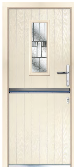
Door Colour: Cream Decorative Glass: Prairie